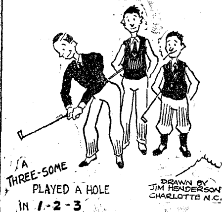
A THREE-SOME PLAYED A HOLE IN 1-2-3